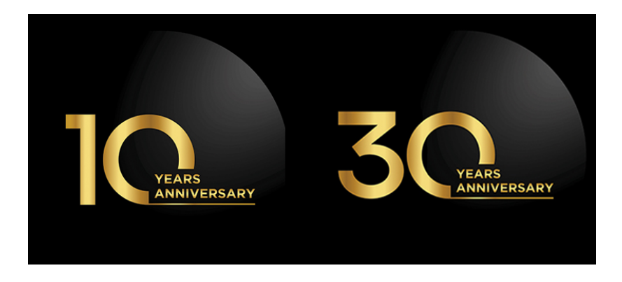
January 2023 - It's a double anniversary for us!

2023 celebrates two significant anniversaries our 10th Year as Bespoke Detection Services LTD incorporating BDS Electrical, and 30 years when I decided to go it alone with a £5K Loan and start up BDS then as Building Detection Services and later to be know as BDS Fire & Security.