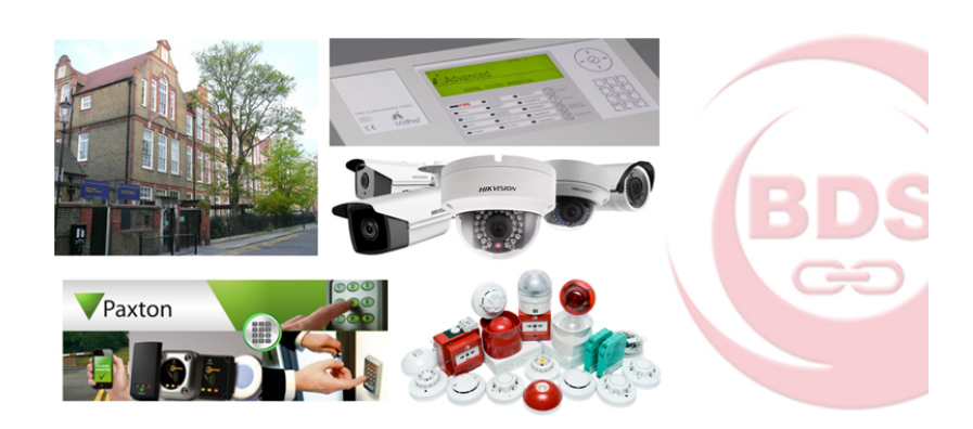
February 2023 - Fire & Security Upgrades to School

The Systems protecting the building were the recently launched KENTEC Taktis Fire Alarm system using Apollo protocol and Baldwyn Boxall's Omnicare.