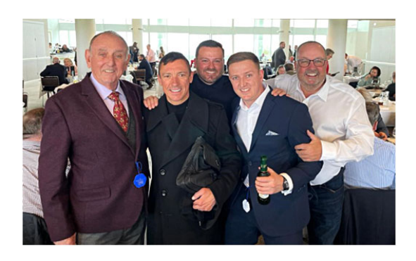
April 2023 - BDS Spring Day Meeting Epsom Downs

At present we will be undertaking the servicing of Fire Alarms, Emergency Lights, AOV's, Dry Risers and Sprinklers.