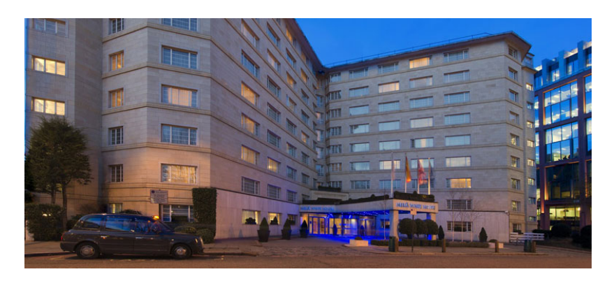
March 2023 - Melia White House

BDS have successfully won the maintenance contract at the Melia White House Hotel. The services provided are for, Fire alarms, Emergency lights, Dry Risers, Ansul Cooker hood Extinguisher systems & Portable Extinguishers. This London hotel with a fantastic location right next to Regent's Park now boasts a stunning new look after a major investment in its transformation.