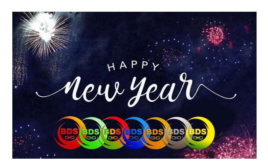
January 2023 - Happy New Year to all our Customers, Suppliers and Friends...

Also, under this contract BDS was asked to provide class 1 RF wireless system to provide temporary coverage. This equipment was manufactured by Evacuator and was from their Synergy range of radio equipment and consisted of a main control station located within the building managers/security room and wireless heat sensors and call points on the project floor.